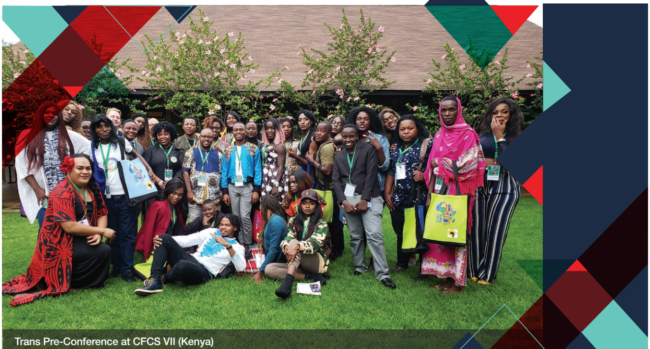
Trans Pre-Conference at CFCS VII (Kenya)