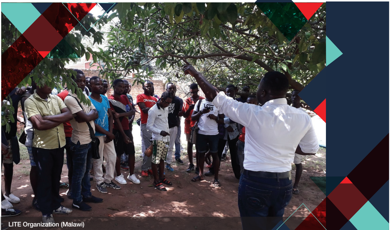
LITE Organization (Malawi)

All current grantee partners that are applying for a grant will need to submit the interim report by the deadline (Feb 1, 2020) in order to be considered. The report will be made available to the GMP during the review of your application.