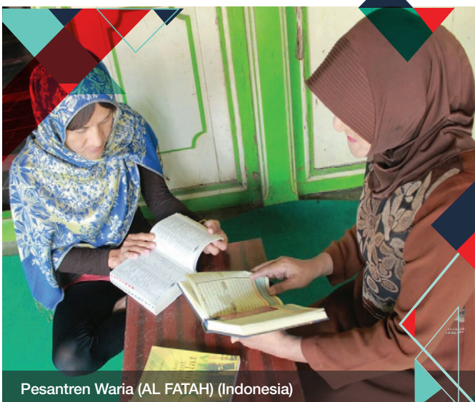
Pesantren Waria (AL FATAH) (Indonesia)

The video must be a maximum of 10 minutes. Please use .mp4 and .mov formats. We appreciate and encourage videos that are "Selfie-style." You can record yourself looking directly at your smartphone, tablet or computer, telling us about your organization's work. No special effects, labels, or editing are required. Videos will not be accepted if we cannot see who is speaking on behalf of the organization.