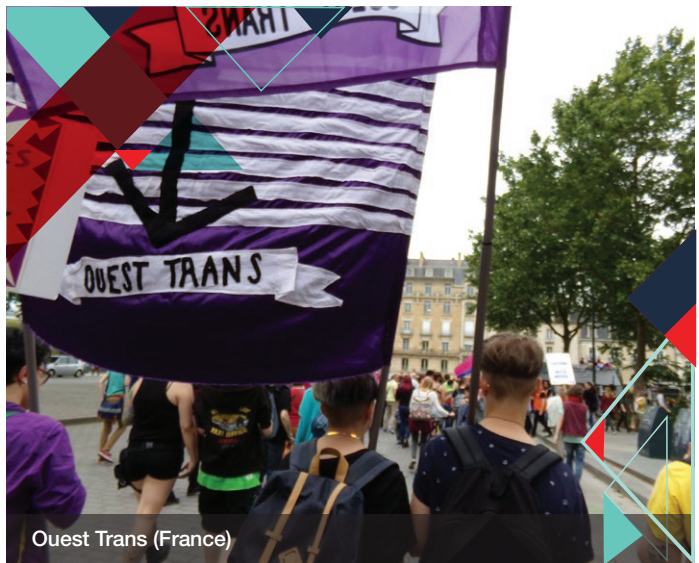
Quest Trans (France)