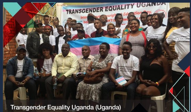
Transgender Equality Uganda (Uganda)