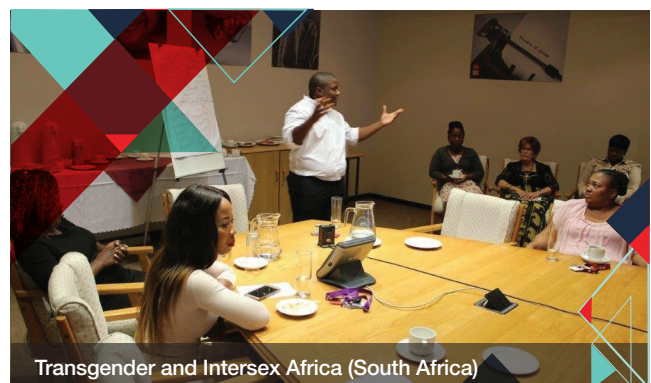
Transgender and Intersex Africa (South Africa)